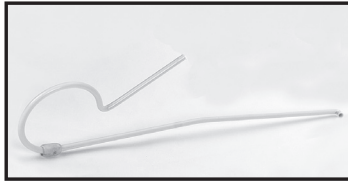
Leg (1 left & 1 right)